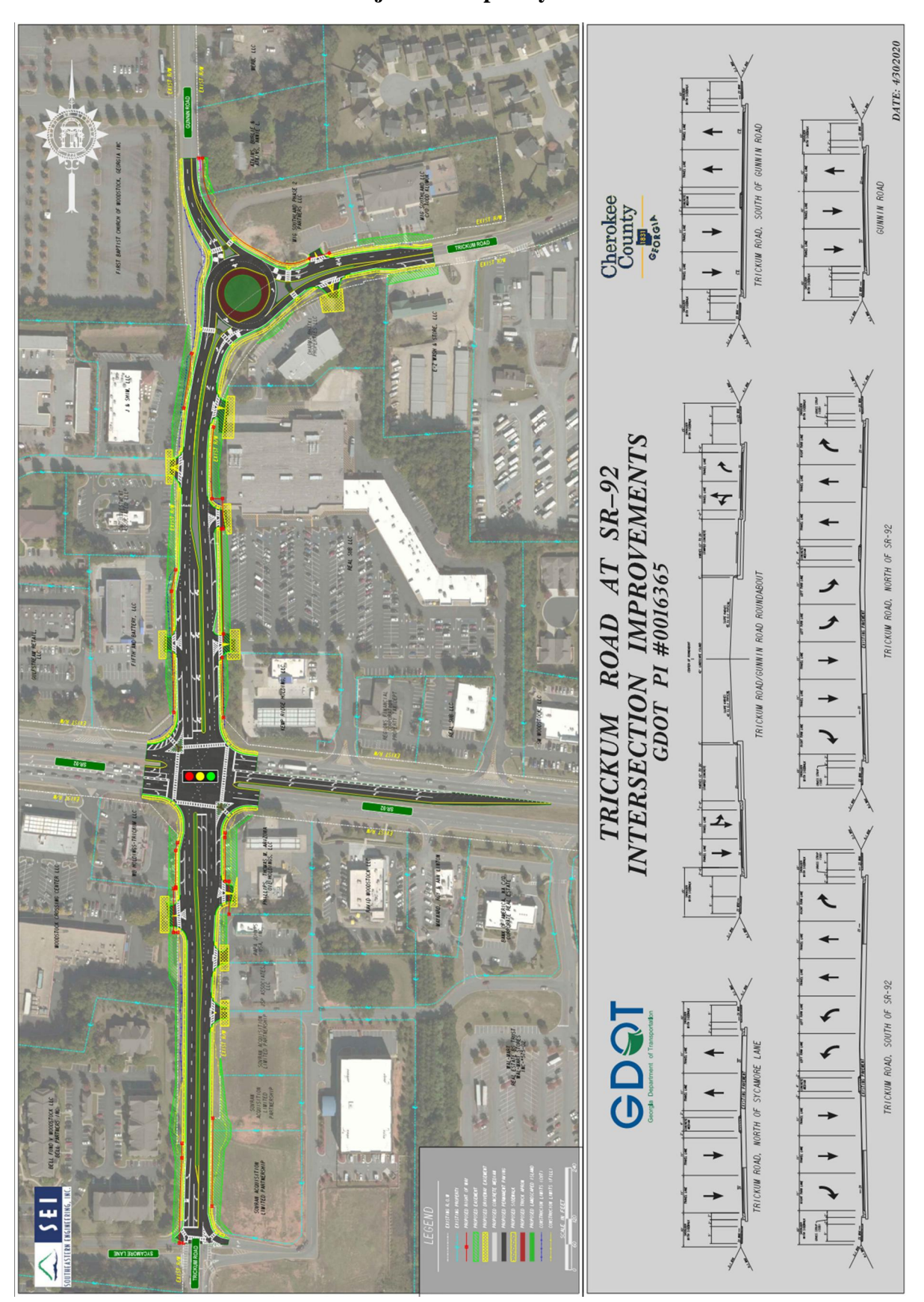
Project Concept Layout