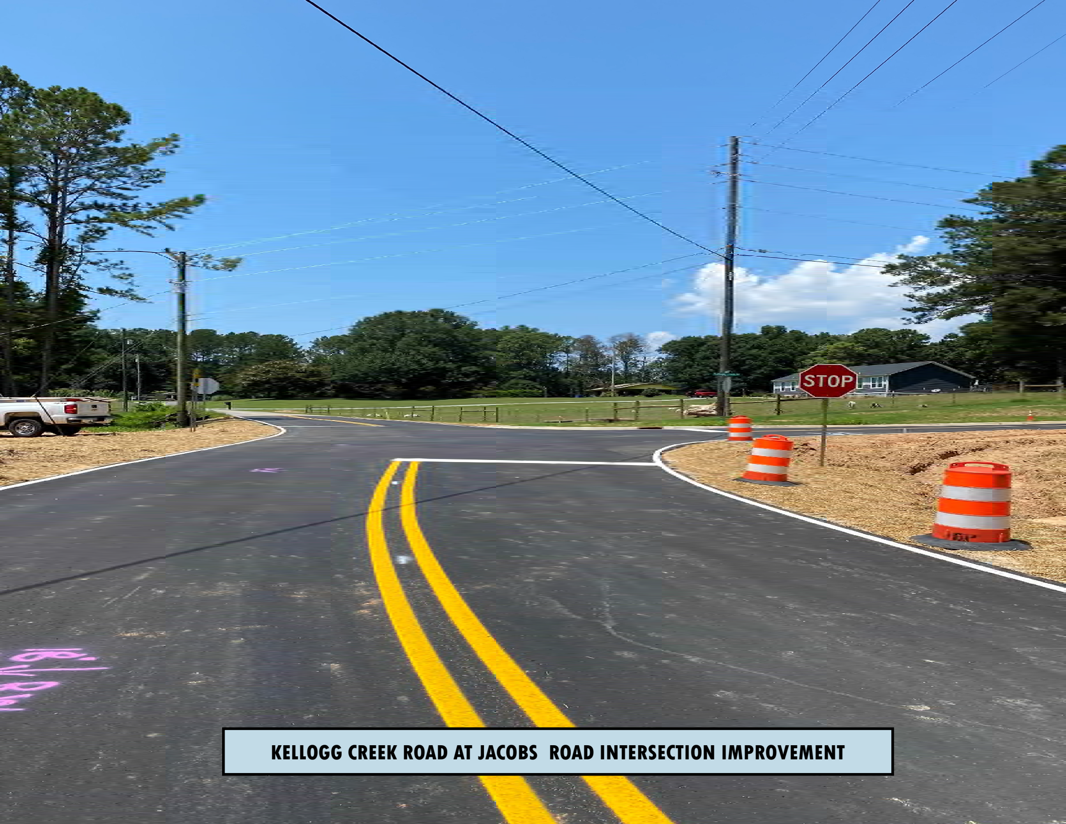
KELLOGG CREEK ROAD AT JACOBS ROAD INTERSECTION IMPROVEMENT