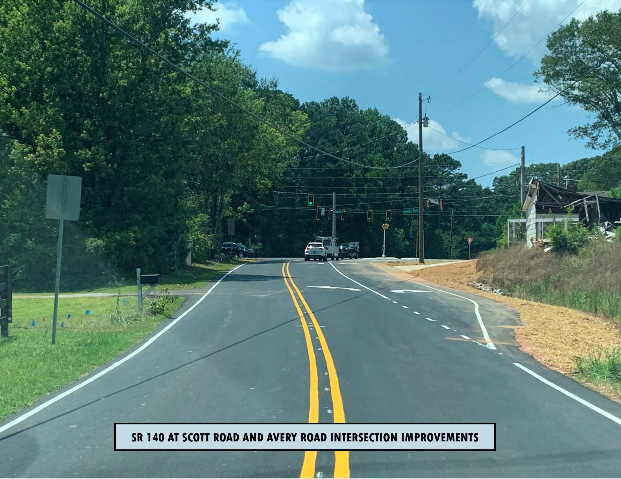
SR 140 AT SCOTT ROAD AND AVERY ROAD INTERSECTION IMPROVEMENTS