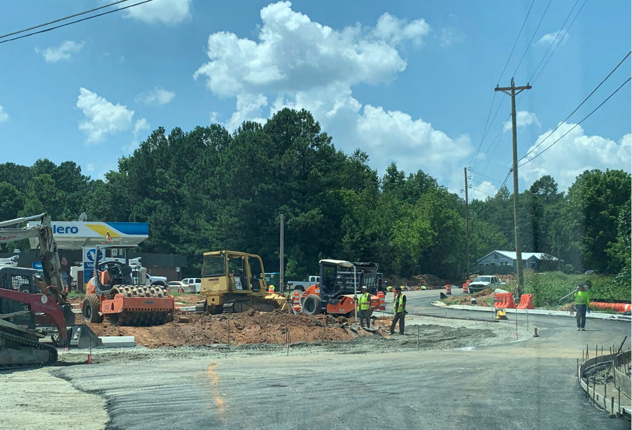
UNION HILL ROAD AT LOWER UNION HILL ROAD IMPROVEMENTS