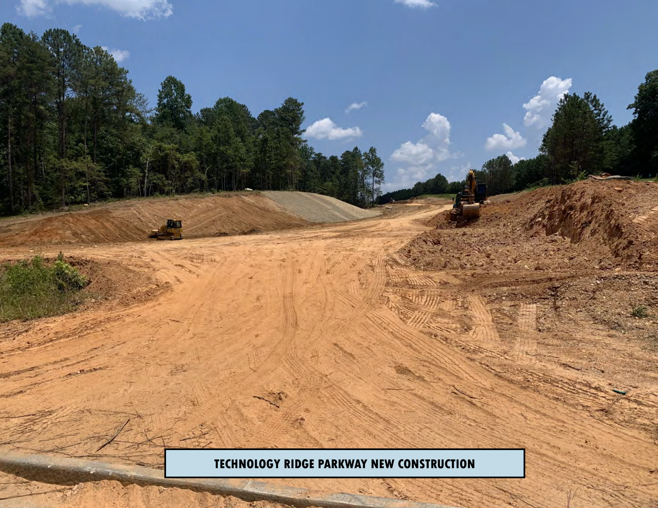
TECHNOLOGY RIDGE PARKWAY NEW CONSTRUCTION