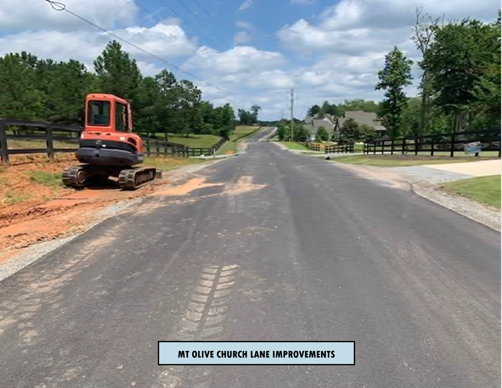
MT OLIVE CHURCH LANE IMPROVEMENTS