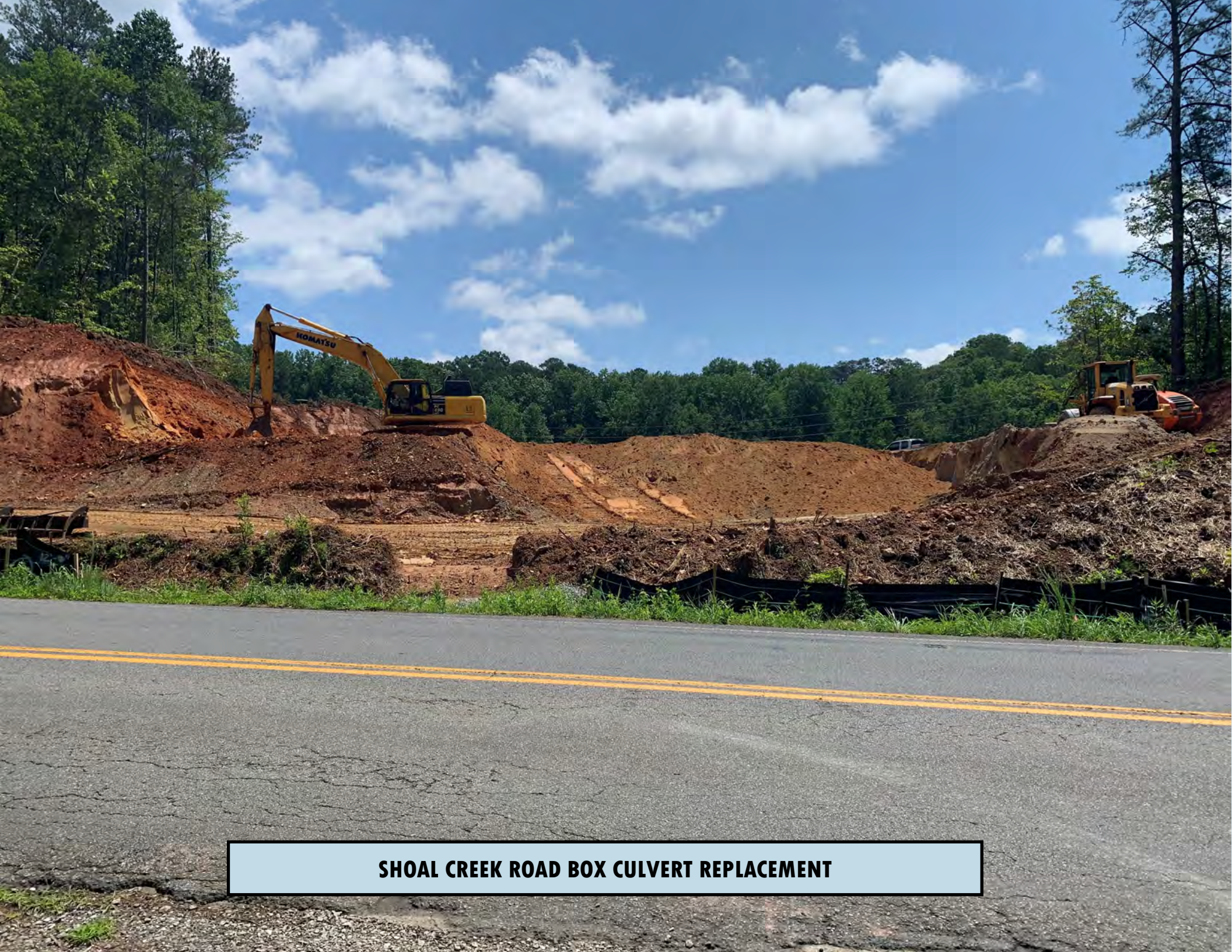
SHOAL CREEK ROAD BOX CULVERT REPLACEMENT