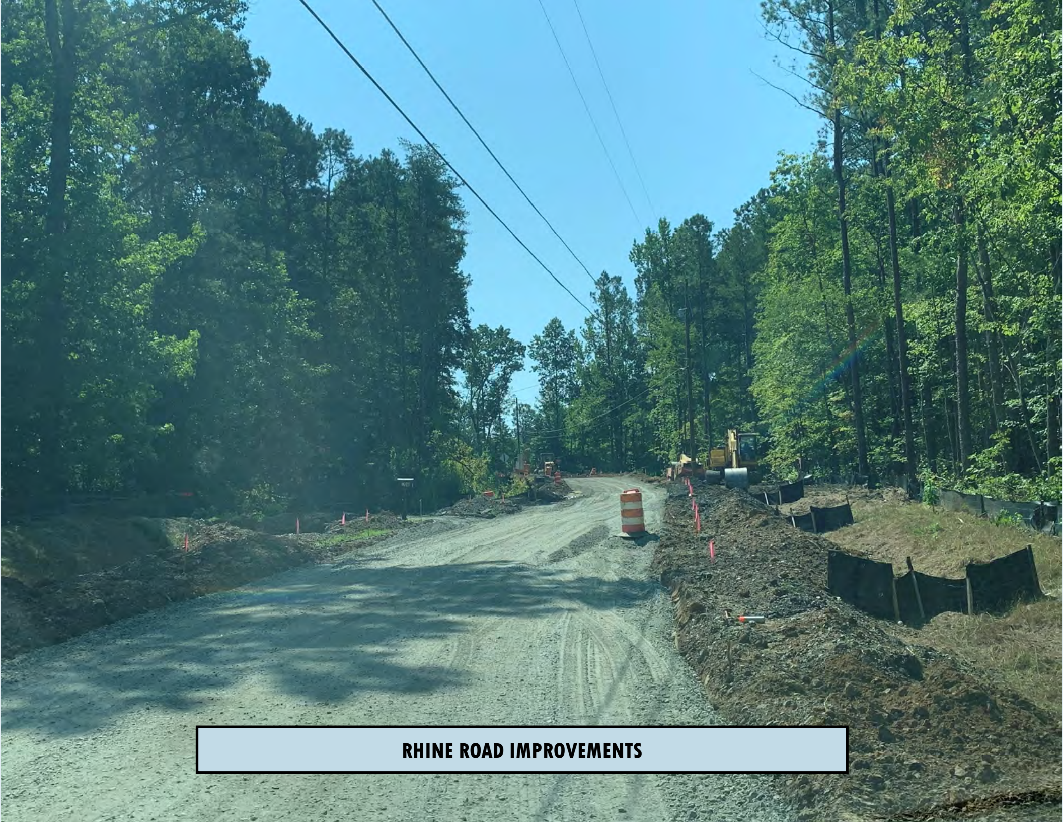
RHINE ROAD IMPROVEMENTS