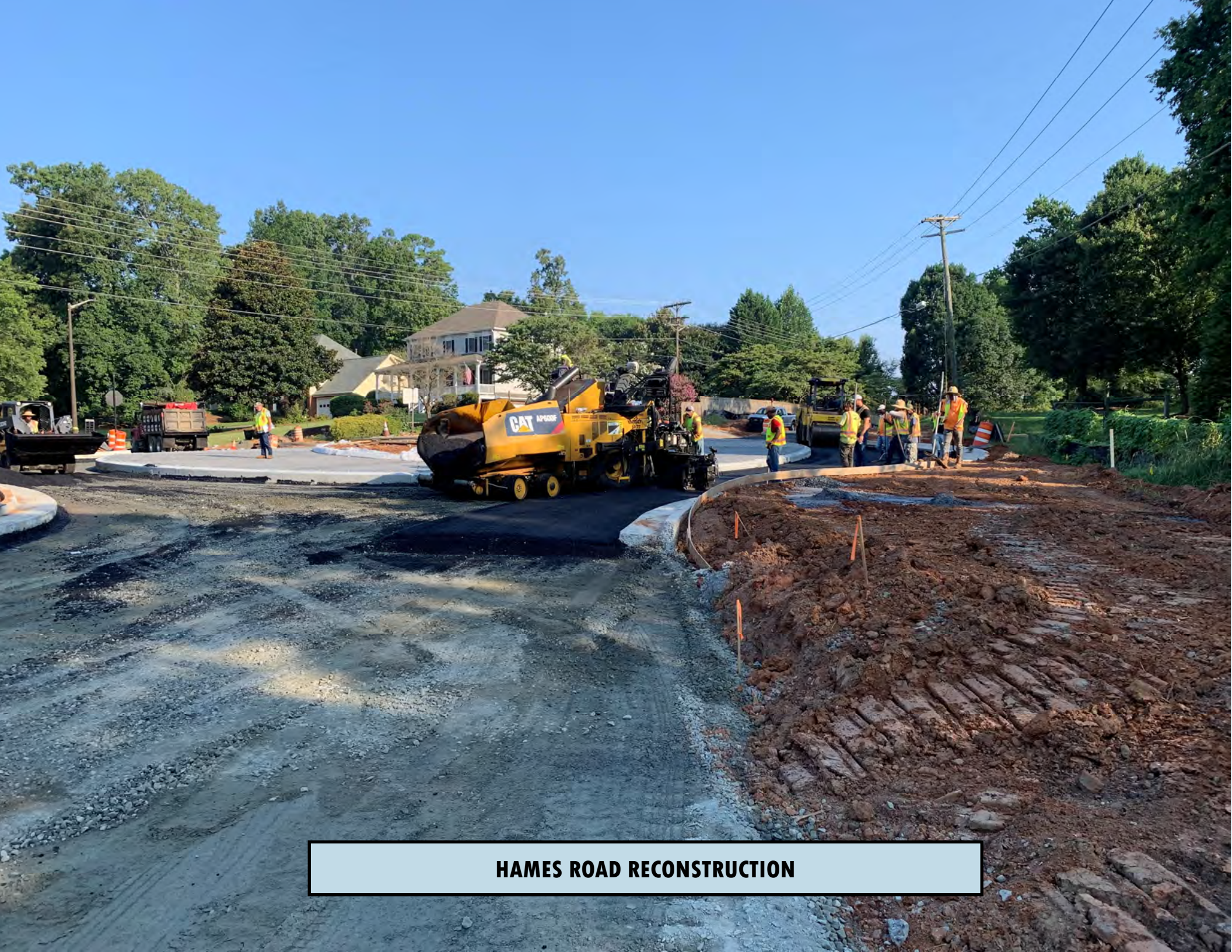
HAMES ROAD RECONSTRUCTION