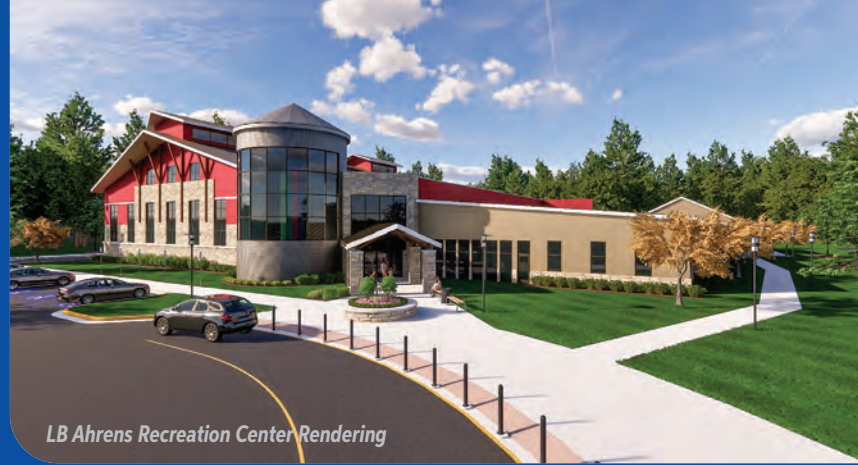
LB Ahrens Recreation Center Rendering